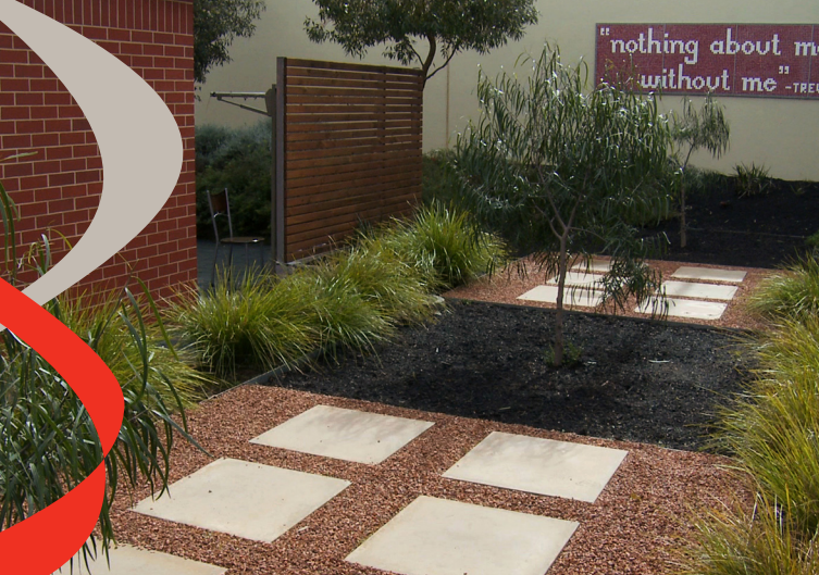
Trevor Parry Centre