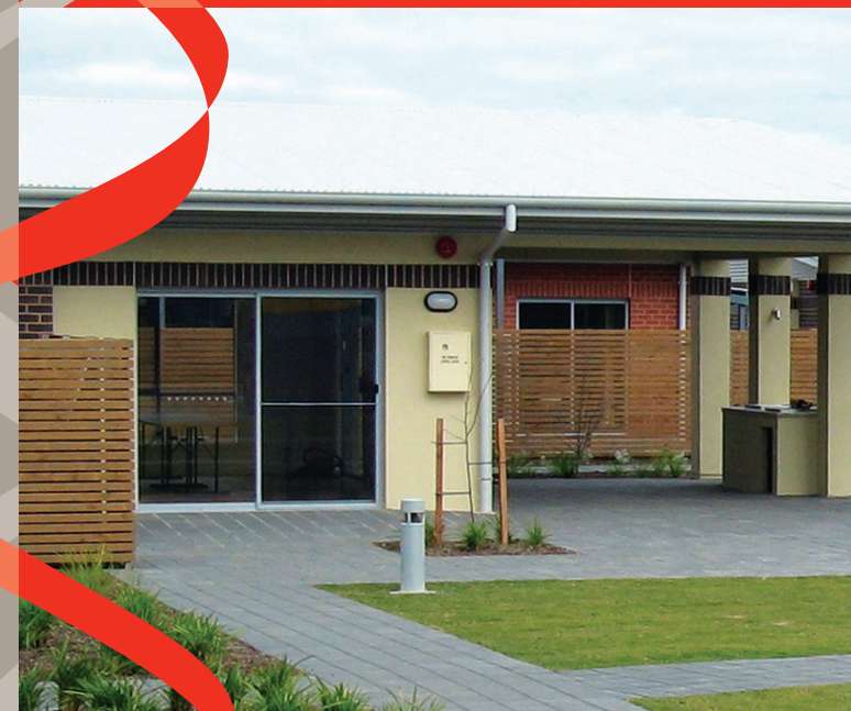
Community Rehabilitation Centre