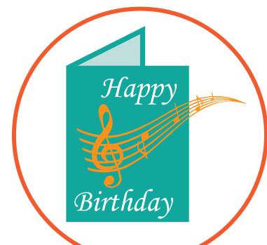
musical card & other novelty items