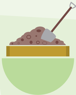
ADD organic matter