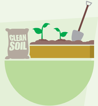
USE raised garden beds with CLEAN soil