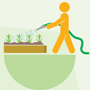
USE mains water