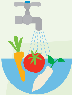
WASH ALL produce before eating