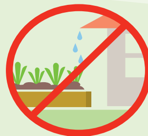
DON'T grow produce around drip line of house