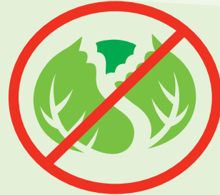
DON'T grow and eat leafy vegetables