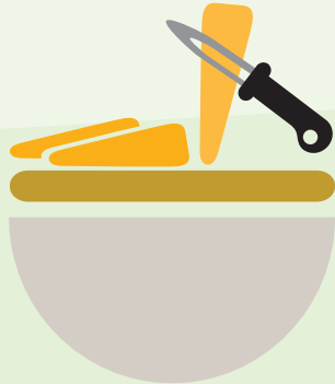
PEEL fruit and vegetables