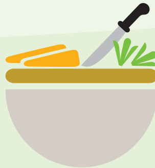
REMOVE and discard outer leaves