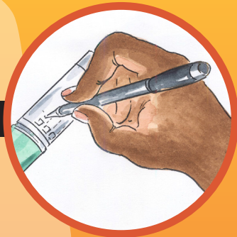
1. Write on tube label