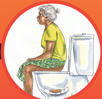
3. Next poo, repeat with second tube