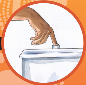
5. Flush toilet