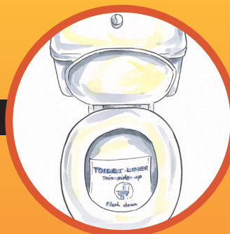
3. Put liner in toilet