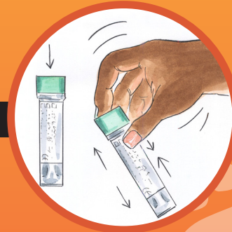
4. Put stick back in tube, shake