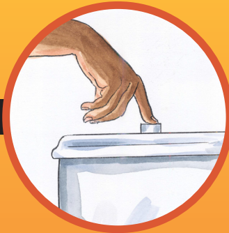
2. Do a wee and flush