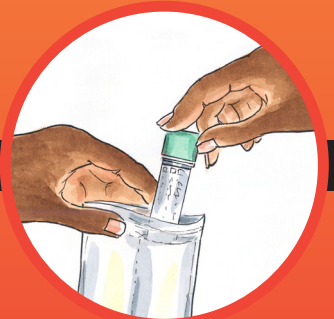
1. Place tube in bag 2. Put sample in fridge