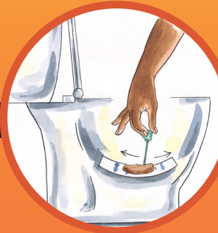
3. Scrape stick through poo