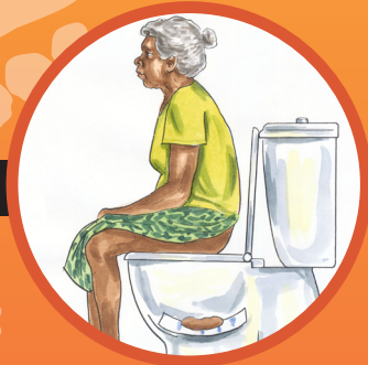
1. Do a poo