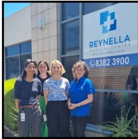
Photo: SALHN GP Integration Unit Team visiting Reynella Medical Centre recently.

Thank you to the Reynella Medical Centre for inviting us to visit your practice in January. It was a pleasure to see your clinic, meet the team and hear your helpful feedback and suggestions.