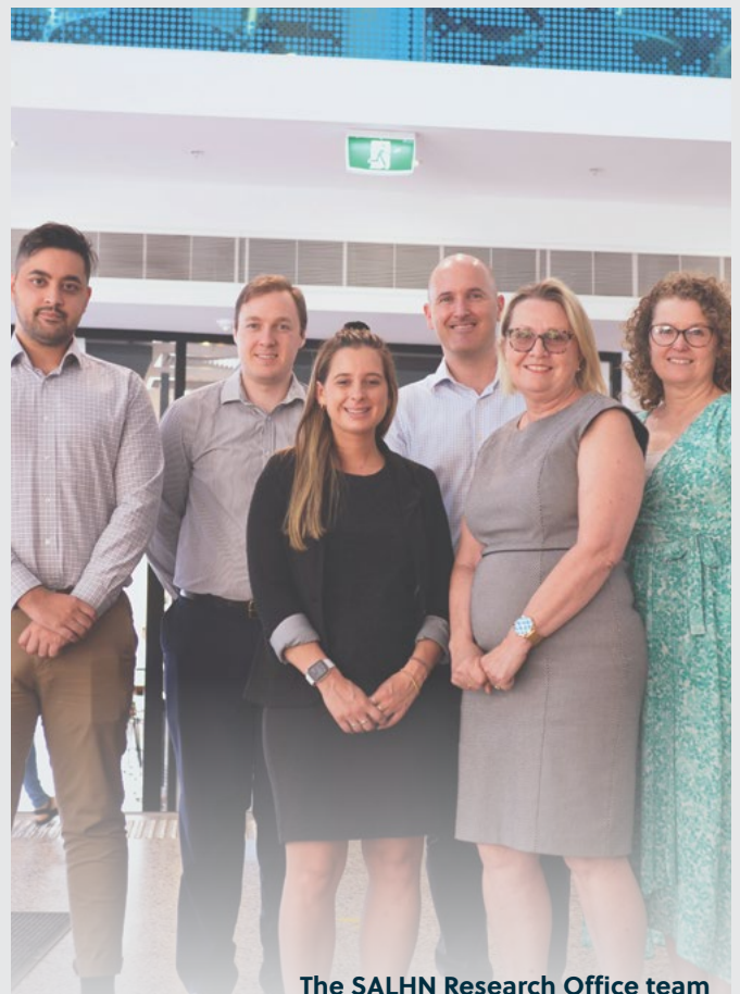
The SALHN Research Office team

"Our goal within the SALHN Office of Research is to provide enquiry services that are world-class. Initiatives such as the staff and student placement program are another stepping stone towards that ambition."