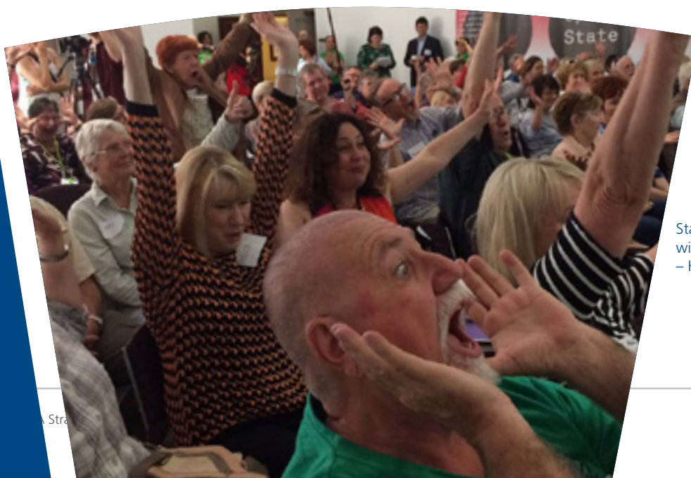
State-wide Conversation with Older South Australians – Hands Up

South Australia is a great place to live, contribute and spend a lifetime.”