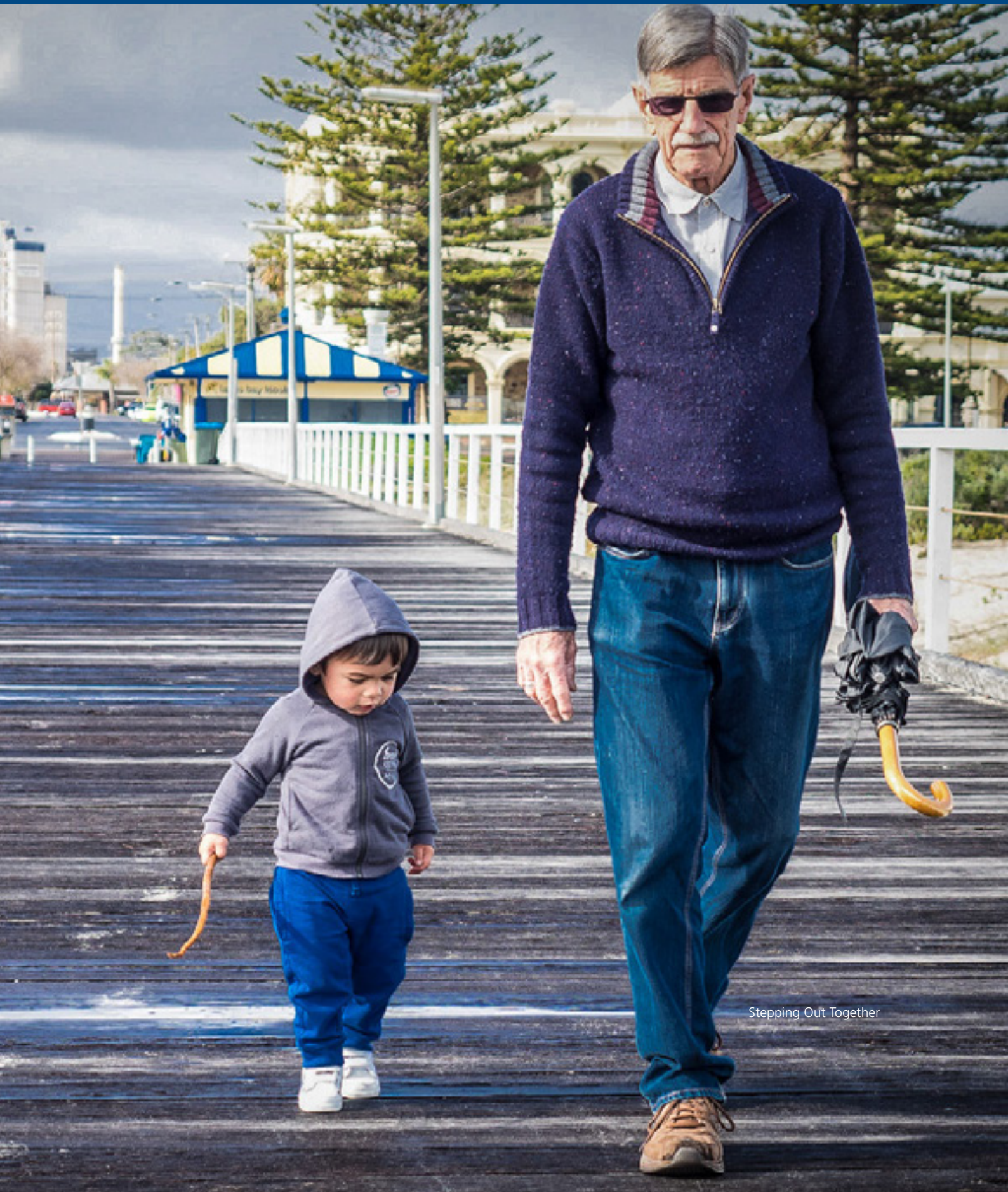
Stepping Out Together