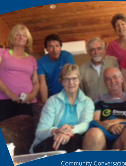
Community Conversation Semaphore