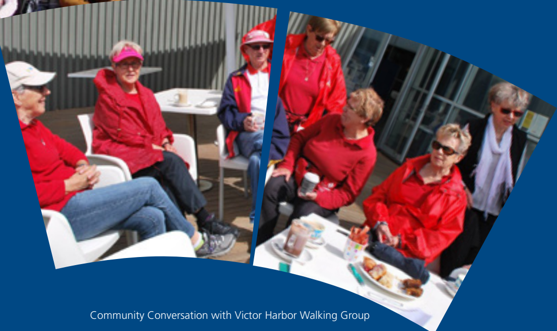
Community Conversation with Victor Harbor Walking Group