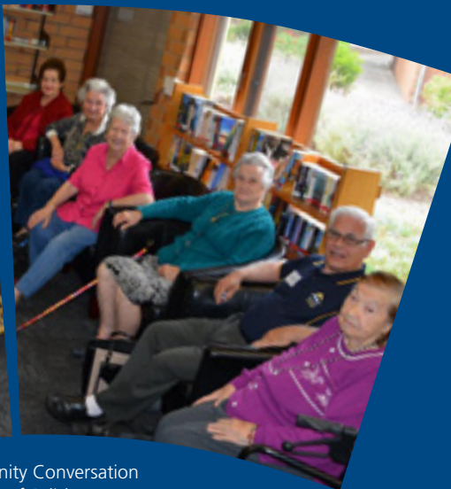
Community Conversation City of Salisbury