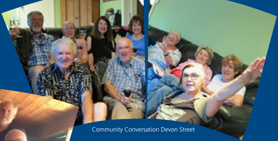
Community Conversation Devon Street