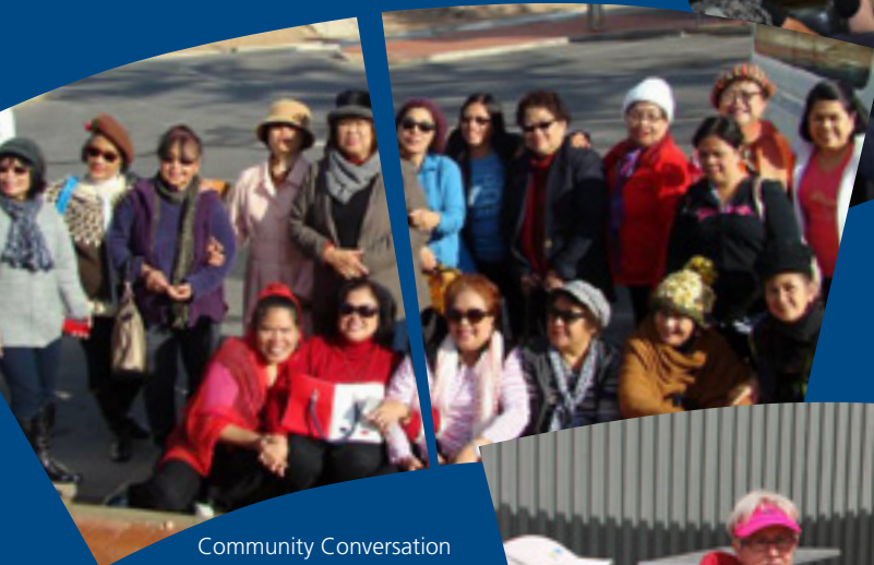
Community Conversation Kapamilya Filipino Group