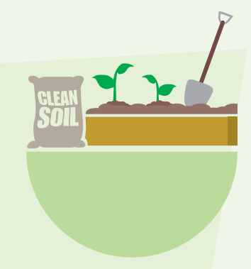
USE raised garden beds with CLEAN soil