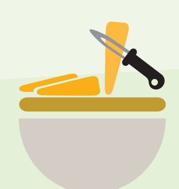
PEEL fruit and vegetables