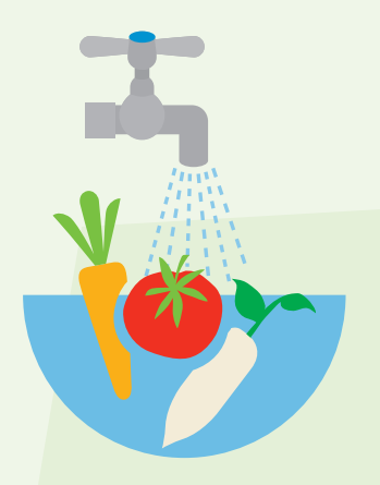
WASH ALL produce before eating