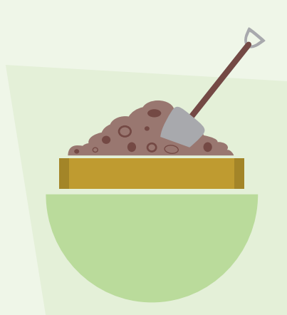
ADD organic matter