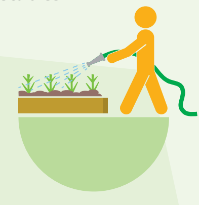
USE mains water