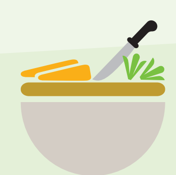
REMOVE and discard outer leaves