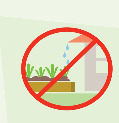
DON'T grow produce around drip line of house