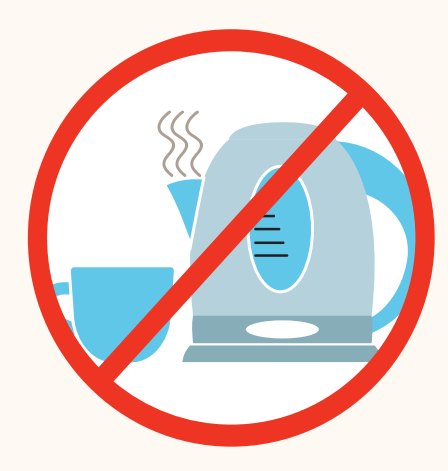
DON'T use rainwater for tea or coffee