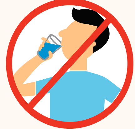
DON'T drink rainwater or use for ice cubes