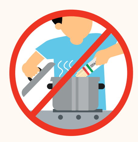
DON'T use rainwater to cook or prepare food