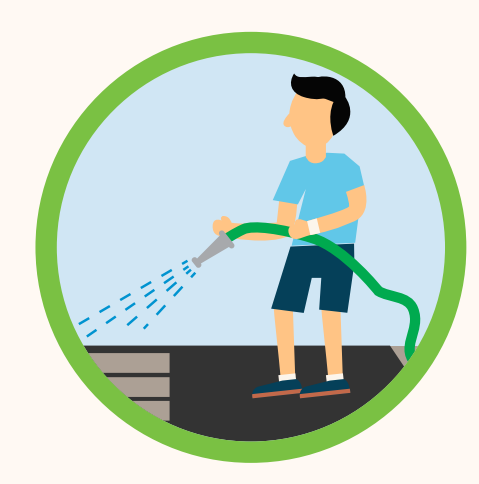
YES can be used for hosing down of hard outdoor surfaces