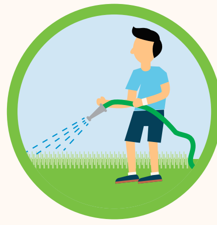
YES rainwater can be used for watering lawns edible gardens must use mains water