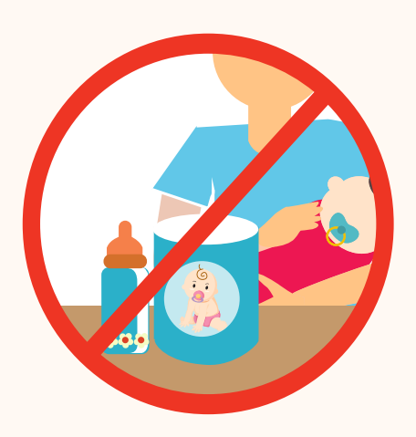
DON'T use rainwater for baby food or formula