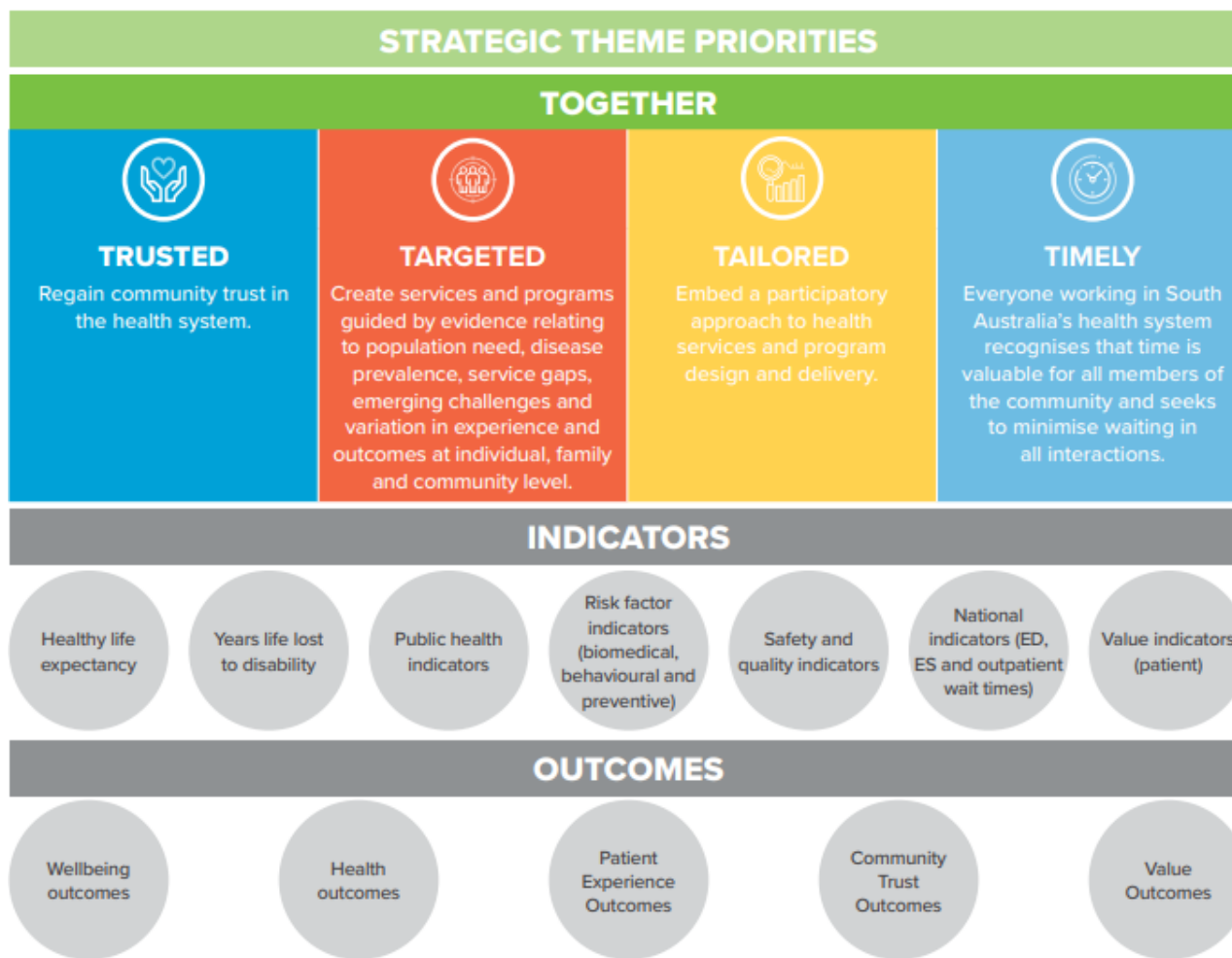
Figure 2. Strategic Theme Priorities of SA Health (SA Health and Wellbeing Strategy 2020-2025)

This framework provides direction for the Allied Health workforce to deliver safe and effective services aligned to the strategic themes / priorities of the SA Health and Wellbeing Strategy (2020-2025) (Figure 2).