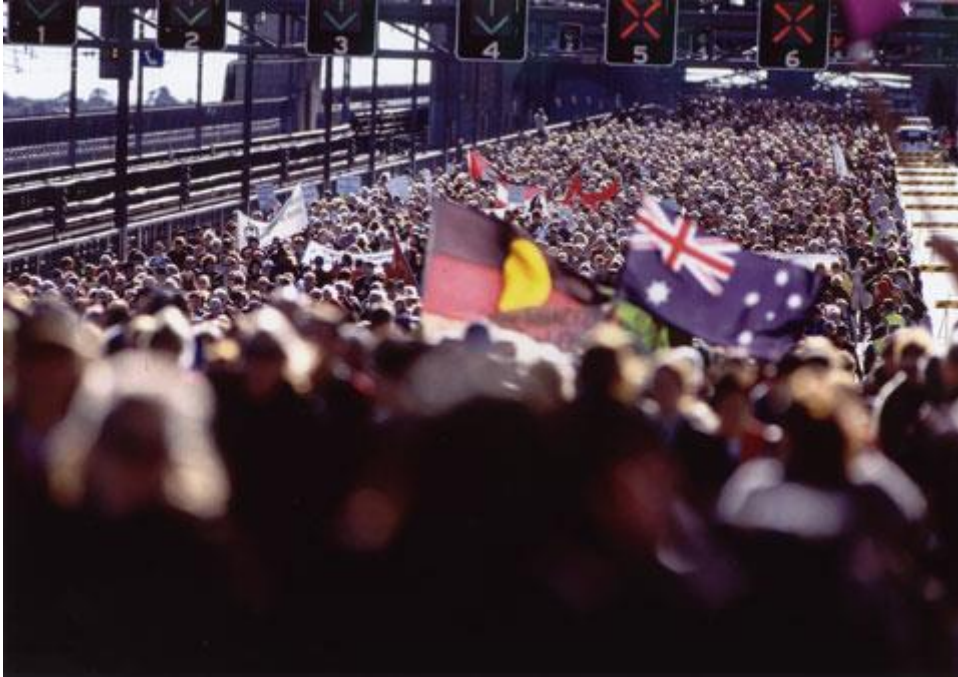
Sydney Harbour Bridge During the Walk for Reconciliation

National Museum Australia, 2013, Symbols of Australia , viewed 24/10/2013, https://www.nma.gov.au/defining-moments/resources/walk-for-reconciliation