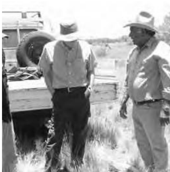
Attorney-General John Rau visits De Rose Hill Station, the first South Australian Native Title Claim to receive a Consent Determination

Native title rights and interests are different from land rights in that land rights are a grant of title from government. The source of Native Title rights and interests is the system of traditional laws and customs of the Native Title holders themselves. There have been several Native Title Consent Determinations in South Australia, and many Indigenous Land Use Agreements are in place x .