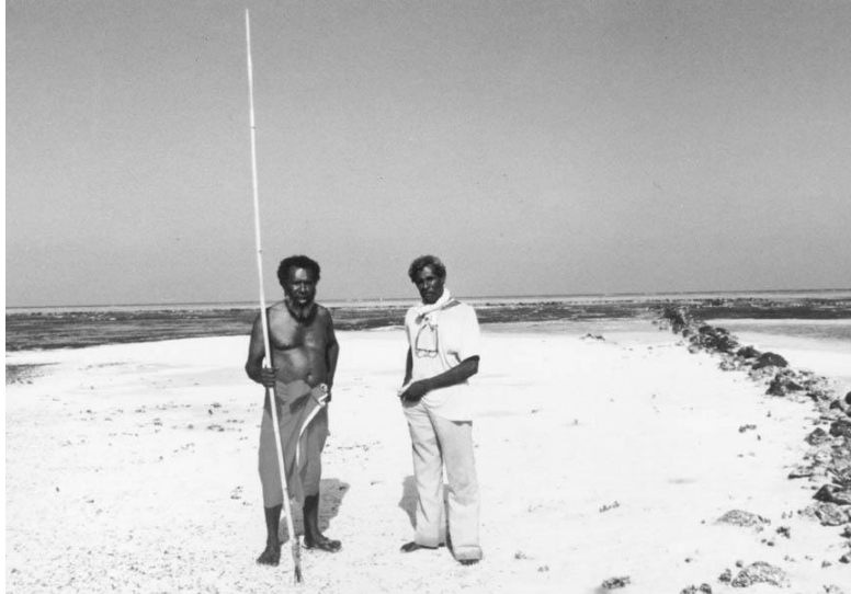
Eddie Mabo on the Island of Mer

Museum of Australian Democracy, 2012, Documenting a Democracy , viewed 28/9/12, < http://foundingdocs.gov.au/enlargement-eid-86-pid-33.html >