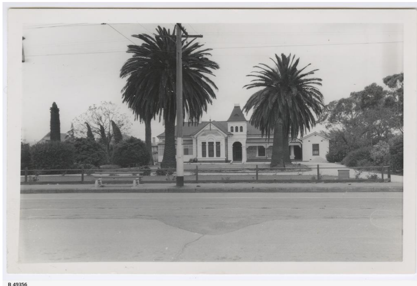
Colebrook Home in Eden Hills, Adelaide ca. 1930

In 1944 the Colebrook Home moved to Eden Hills in Adelaide where the children attended school on site until 1953, because other schools refused to accept them. Colebrook Home was closed in 1981, and the Eden Hills building no longer exists. The Colebrook Blackwood Reconciliation Park was opened at the site iv .